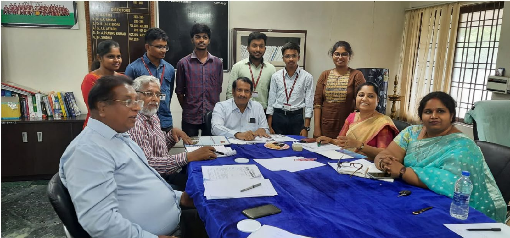
IEOM Student Chapter at JNTUH University College of Engineering Hyderabad, Kukatpally, Hyderabad, Telangana, India