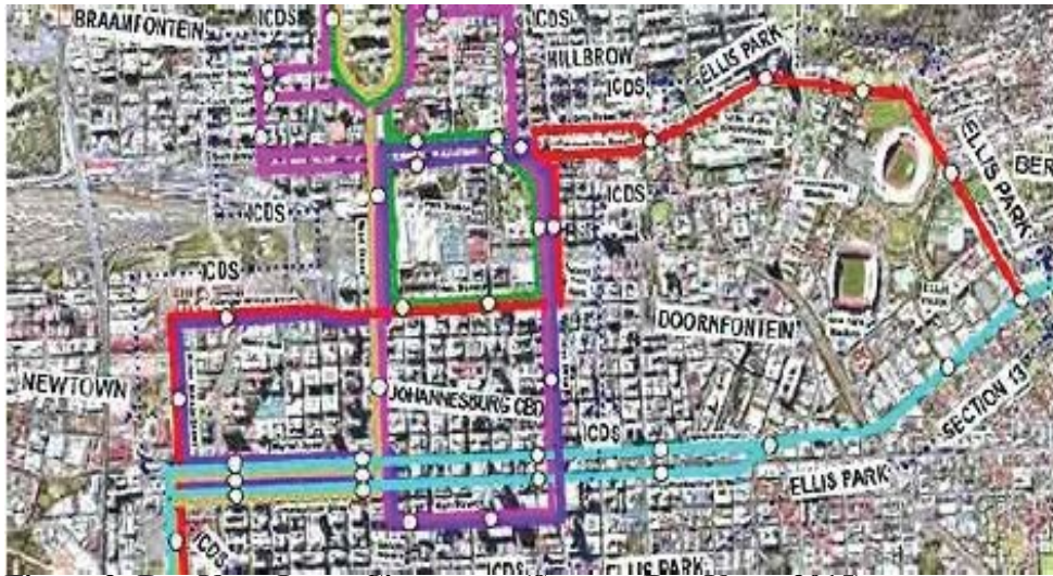
Figure 2: Rea Vaya Inner City routes

Pennyville, New Canada, Highgate, Auckland Park and Braamfontein to Parktown, Metro Centre and Rissik Street in the CBD.