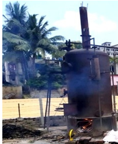
Fig-f Non standard auto rice mill boiler