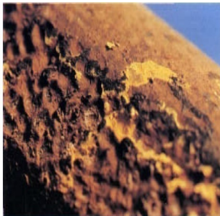
Fig-h Fly ash corrosion

Heat transfer will be affected in case of soot deposits. Sometimes it desirable to clean soot in every six month. Many operator do not clean flow gas path timely. Chimney temperature indicates when flow gas path will clean.