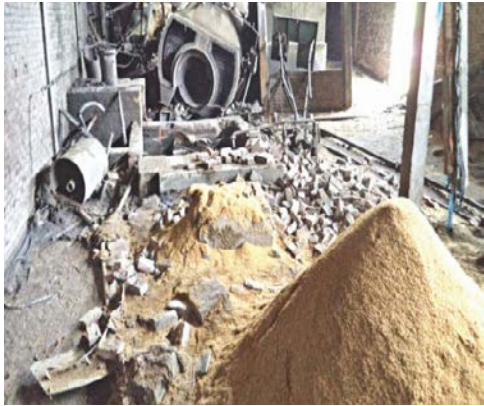
Fig-1 Boiler Accident at Jumuna Auto Rice mill, Dinajpur.