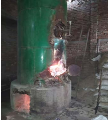
Fig-e Non standard Feed mill boiler

According to Bangladesh boiler regulations 1951, 3(3) where no provision is made in these regulations for design or manufacture of any pressure parts of the boiler, the inspection authority may permit the design, manufacture, stage inspections and certification of such pressure parts including the valve, mounting & fittings conforming to the international standards & foreign codes like B.S, ASME Boiler and pressure vessel code, tubular exchanger manufacturers association (TEMA), technical regulation for steam boilers (TRD), Russian standards (GOST), German Standards (DIN), Japanese industrial standard (JIS) and ISO Boiler code ISO/R-831, which are known to be commonly used in industrially advance countries. In many case we found non standard local made boiler which is very harmful. This boiler are made of normal plate and do not follow any international standard & foreign codes. this kinds of boilers are very risky.