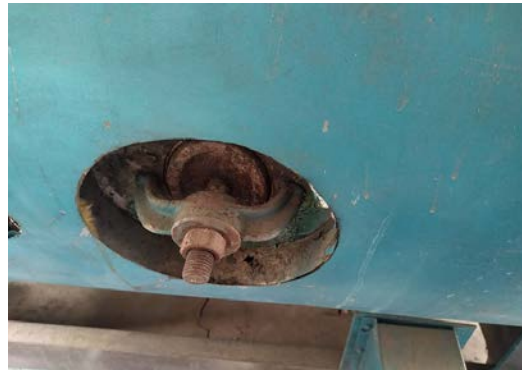
Fig-g Rusting in Manhole cover & Gasket need replacement