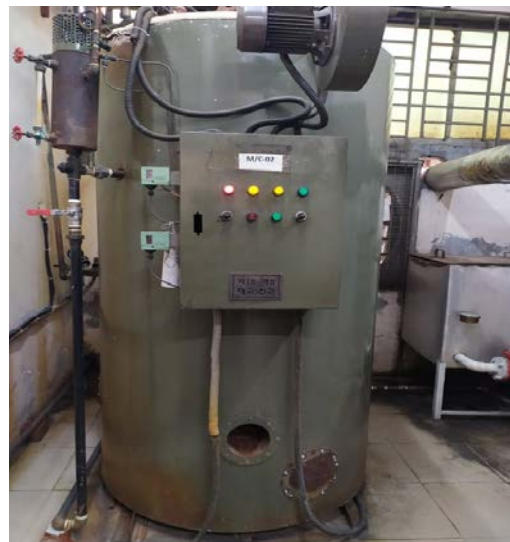
Fig-b Boiler is installed close adjacent to wall