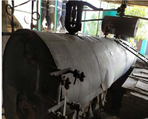
Fig-k Old Boiler