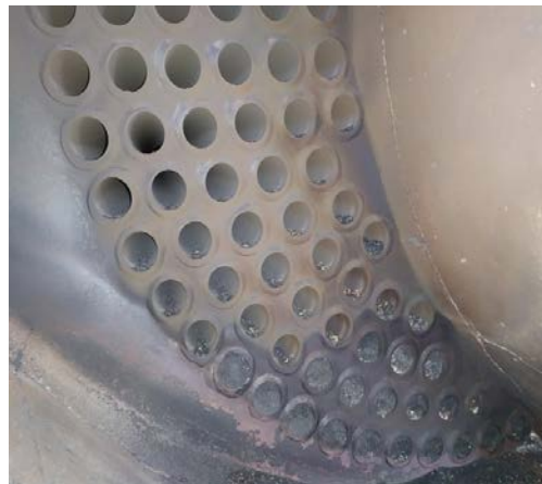
Fig-I Soot accumulated lower side of boilers