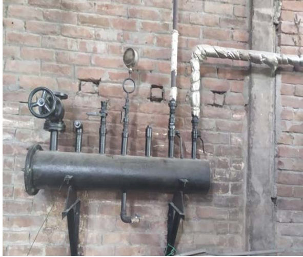
Fig-c Missing insulation in Steam receiver