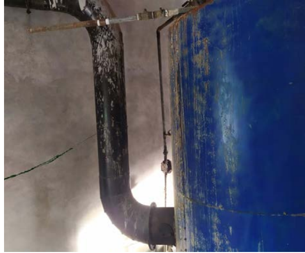
Fig-d Missing insulation in Chimney line