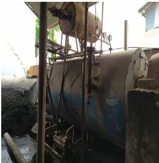
Fig-a No Boiler rooms.

According to the BNBC 2006(3,4) room containing boiler or heating plant shall be effectively separated from the main building by a separated wall. Boiler room shall be situated on the periphery of the basement and shall have a 4 hour fire resistance wall. Boiler door shall have a minimum 2 hour fire resistance wall. Boiler rooms are not enough for doing maintenance activities. Many owners (specially non compliance factory) do not install boiler in separated room. Fresh air required for combustion do not enter to the boiler room properly. Sometime we found no any exhaust fan in boiler room or exhaust fan is very small according to room size or no of exhaust fan are less in number. Due to lacking of exhaust fan, boiler room becomes very hot. If furnace oil, gas or flammable products contacts with this hot temperature fire will produce. As a result, Accident may create. Many feed mills, Auto rice mills, Leather industries & non compliance garments are the example for this topics.