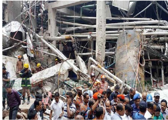
Fig-m Boiler Accident at Multifabs ltd, Gazipur